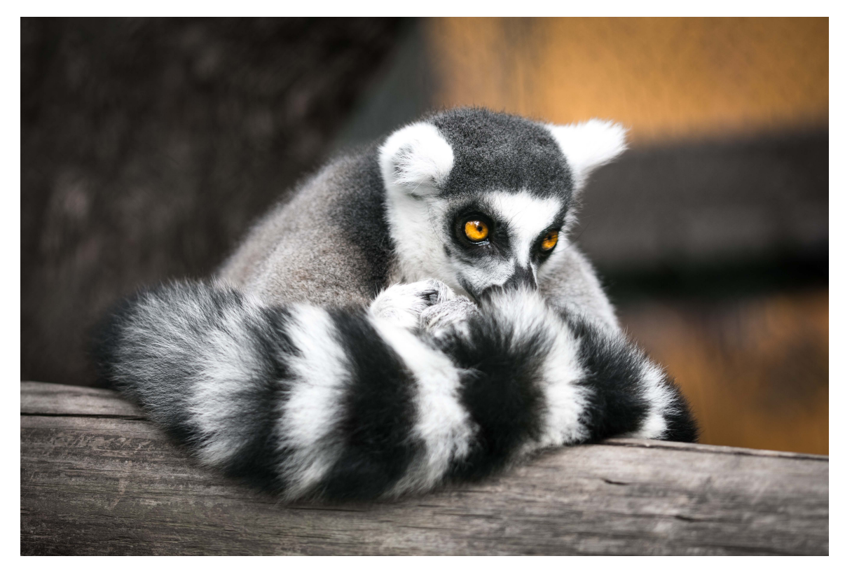
Figure 1: Lemur photograph

LaTeX takes into account line and page breaks when determining where to place floating objects like figures and tables on a page. You can override LaTeX's placement decisions by using the float package options. Consult the <u>float package documentation</u> to learn how to gain more control over where and how float objects display.