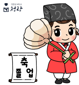
(b) Example subfigure 2