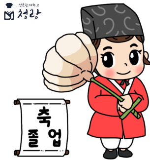
Figure 3.2: Example figure

\begin{figure}[H] \centering \includegraphics[width=.3\textwidth]{demo/fig.png} \caption{Example figure} \label{fig:fig-label} \end{figure}