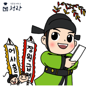
(a) Example subfigure 1

\centering \includegraphics[width=.5\linewidth]{demo/fig.png} \caption{Example subfigure 2} \label{fig:sub-2} \end{subfigure} \caption{Example subfigures} \label{fig:fig-sub} \end{figure}