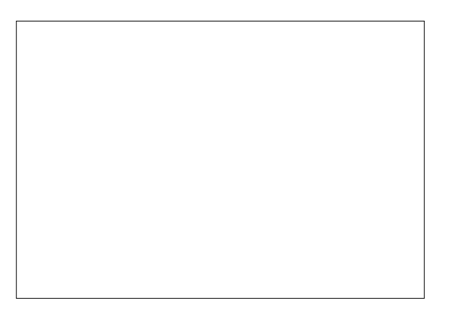
Figure 1. Example of caption. It is set in Roman so that mathematics (always set in Roman: B \sin A = A \sin B ) may be included without an ugly clash.

can report results of other challenge participants together with your results in your paper. For your results, however, you should not identify yourself and should not mention your participation in the challenge. Instead present your results referring to the method proposed in your paper and draw conclusions based on the experimental comparison to other results.