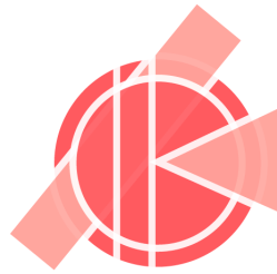
Figure 1: Every figure must have an informative caption and a number. The caption can be placed above, below, or to the side of the figure, as you see fit. The same applies for tables, boxes, and other floating elements.

Paragraphs The paragraph is the smallest unit of sectioning. Feel free to end the paragraph title with a full stop if you find this appropriate.