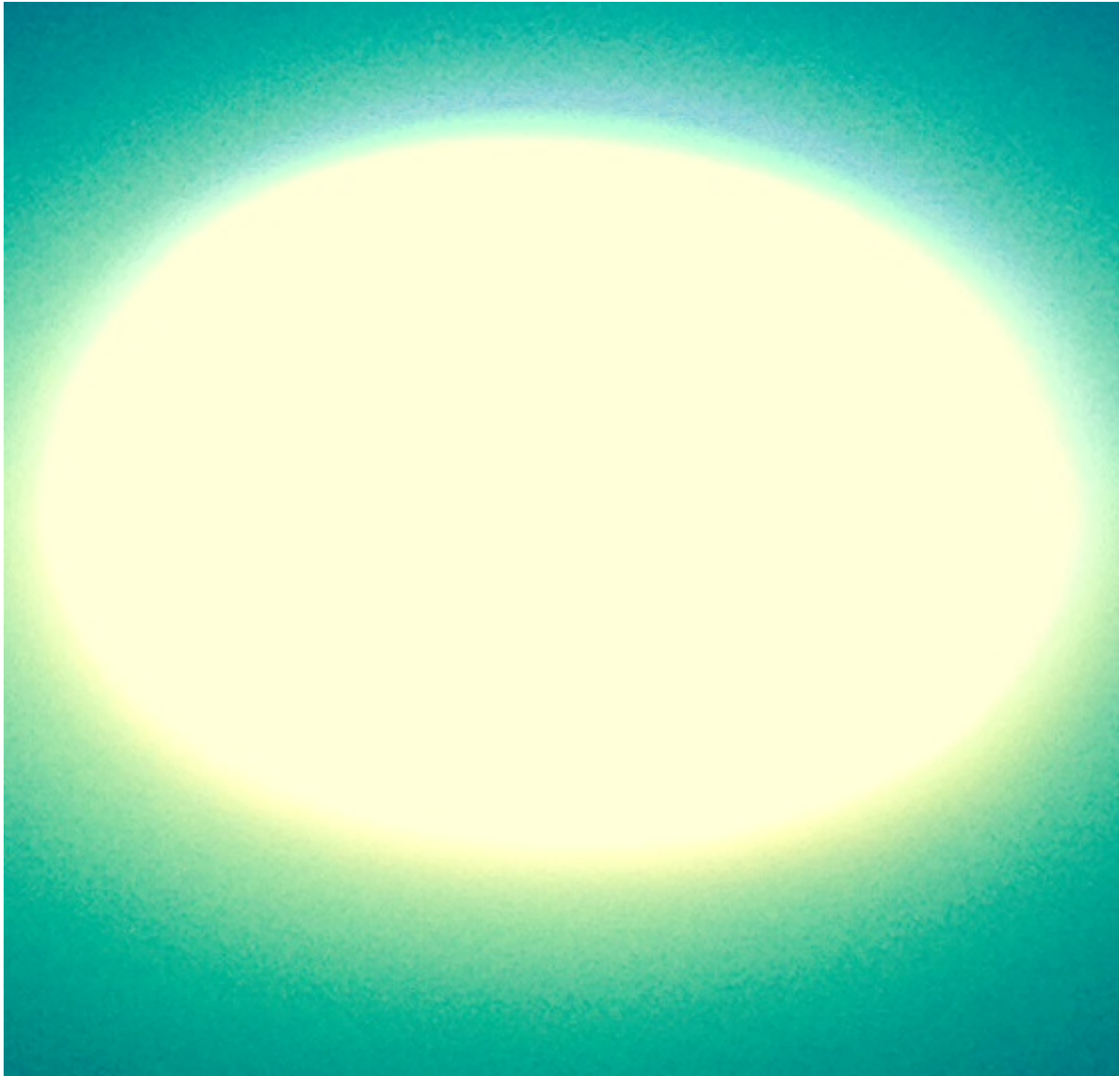
Fig. 2.— our image